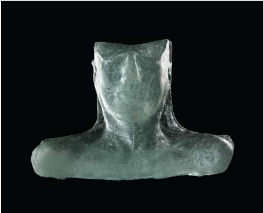
Patient 5, 2010