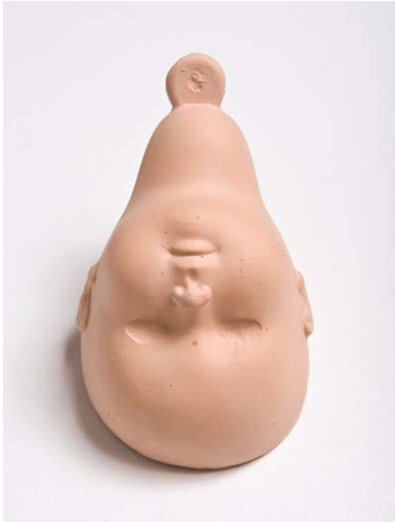
Votives of Desire (Doll's Head), 2010