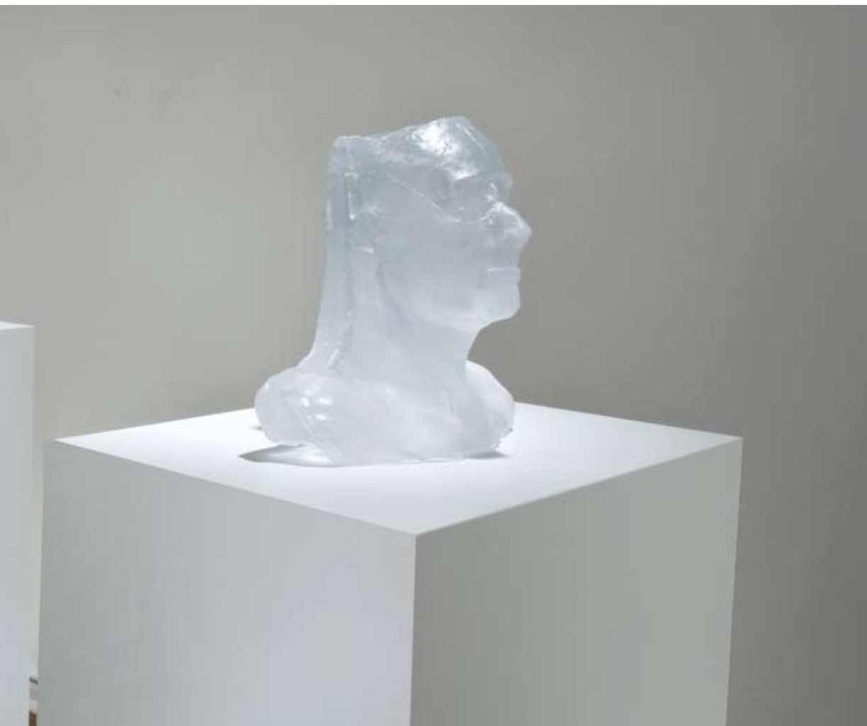
Silent Stories, 2010, installation view