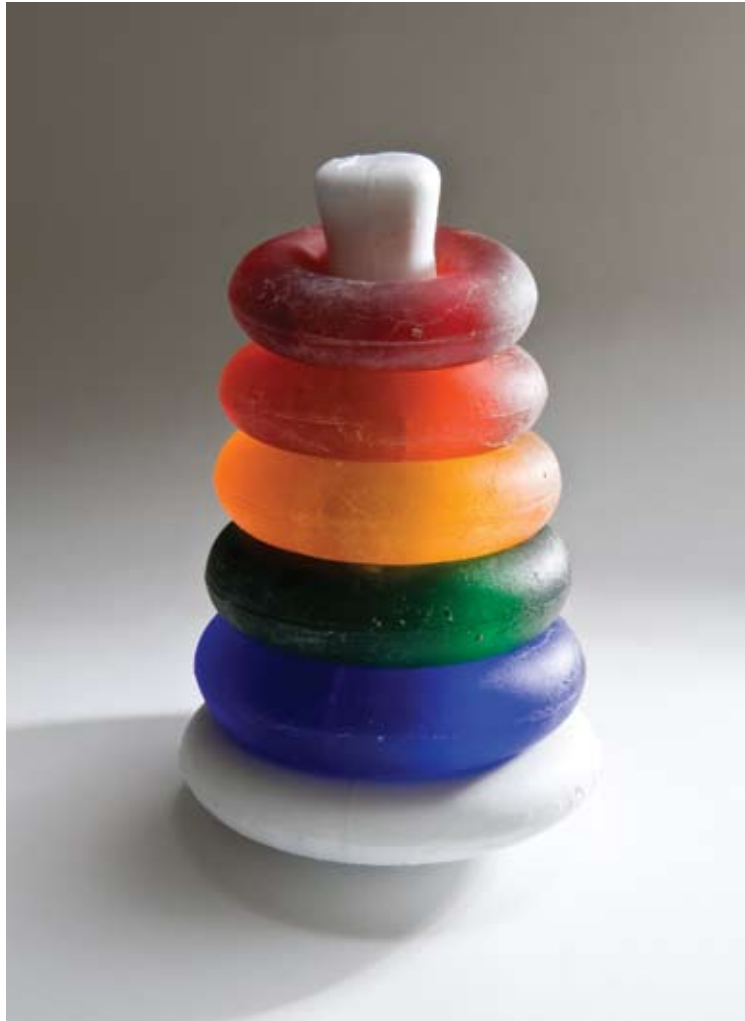
Never Letting Go (Coloured Stacking Rings), 2010