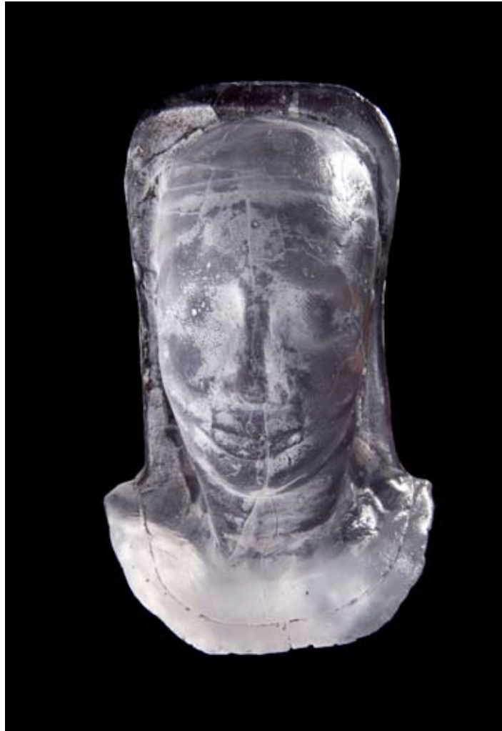
Silent Stories (detail), 2010, front view