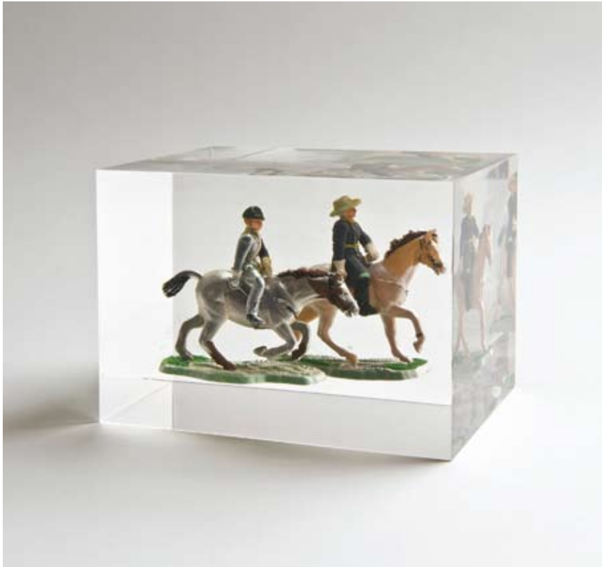
Childhood Tales (Cavalry), 2010