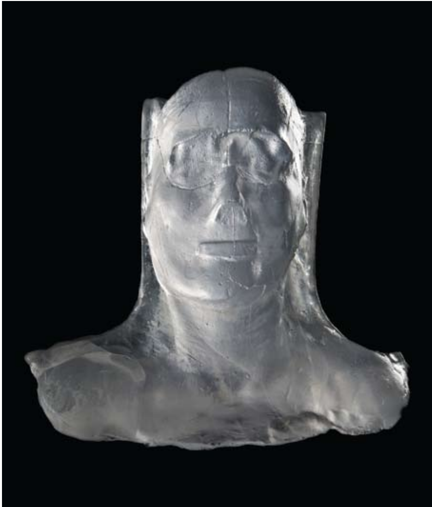
Silent Stories (detail), 2010