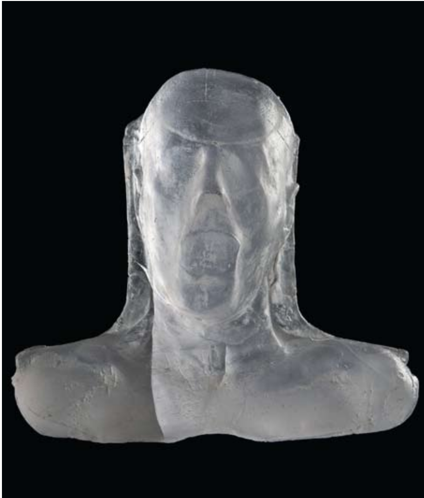
Silent Stories (detail), 2010