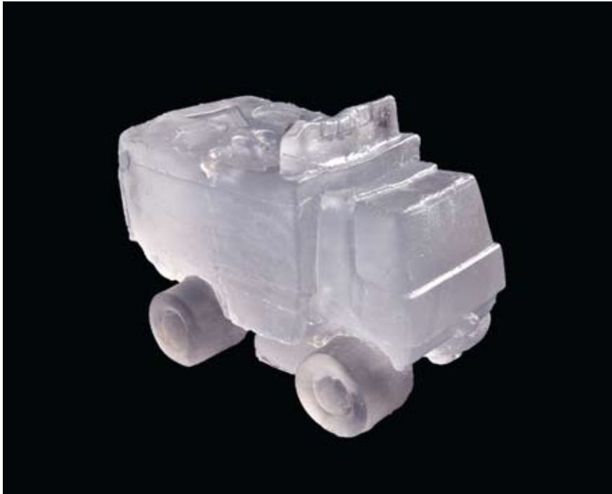
Faded Memories (clear truck), 2010