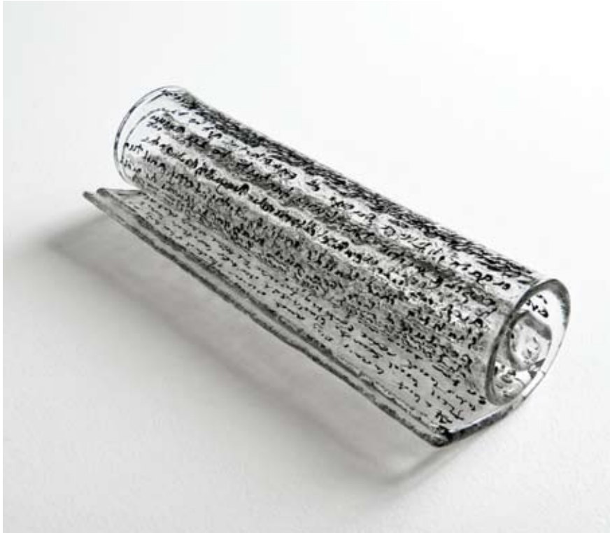
My Diaries, Lamu, 2010