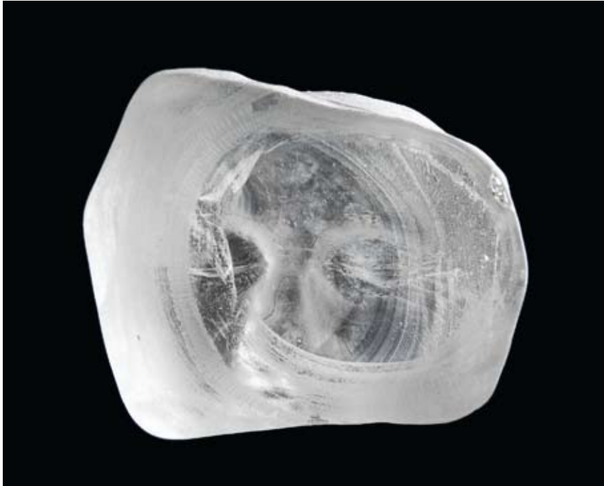
Vanitas I, 2010, back view