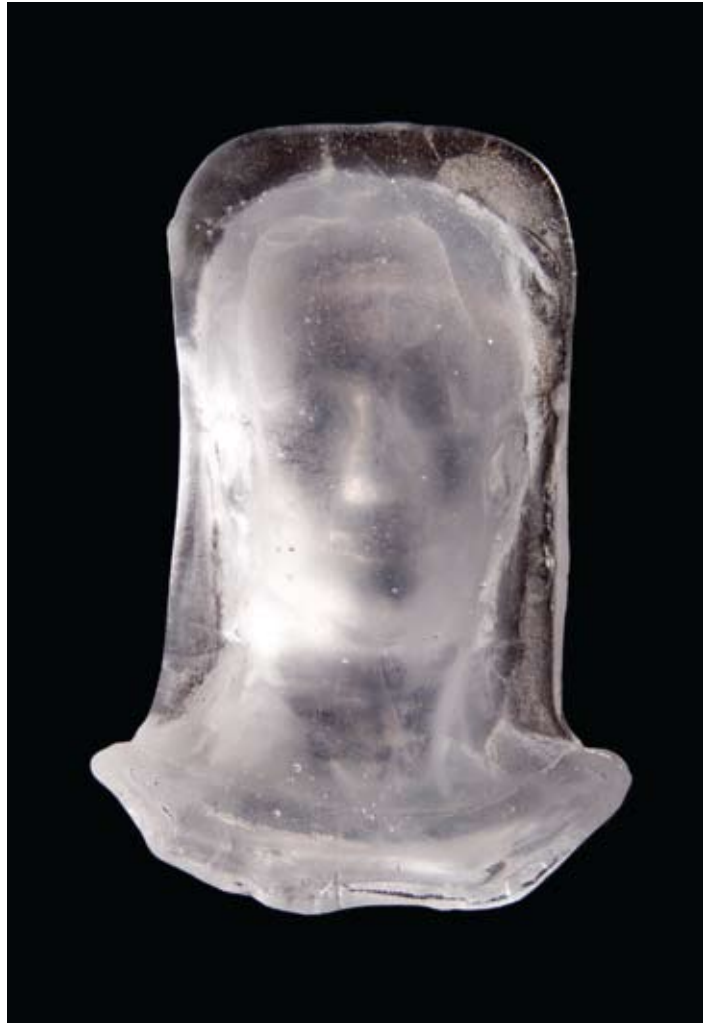
Silent Stories (detail), 2010, back view