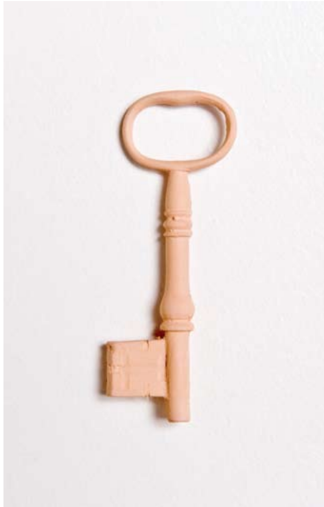
Votives of Desire (Key), 2010