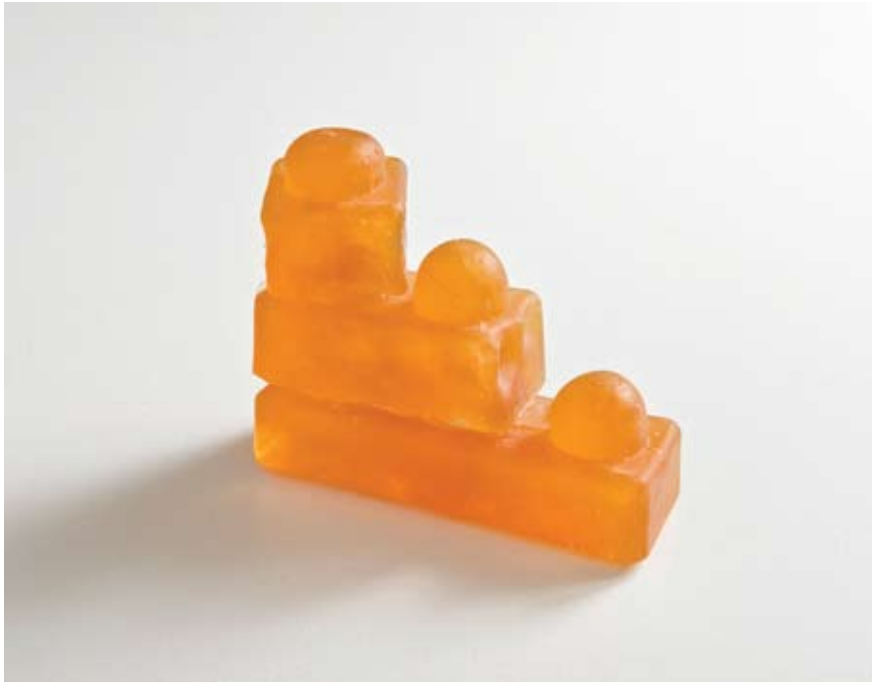
Never Letting Go (Yellow Duplo Blocks), 2010