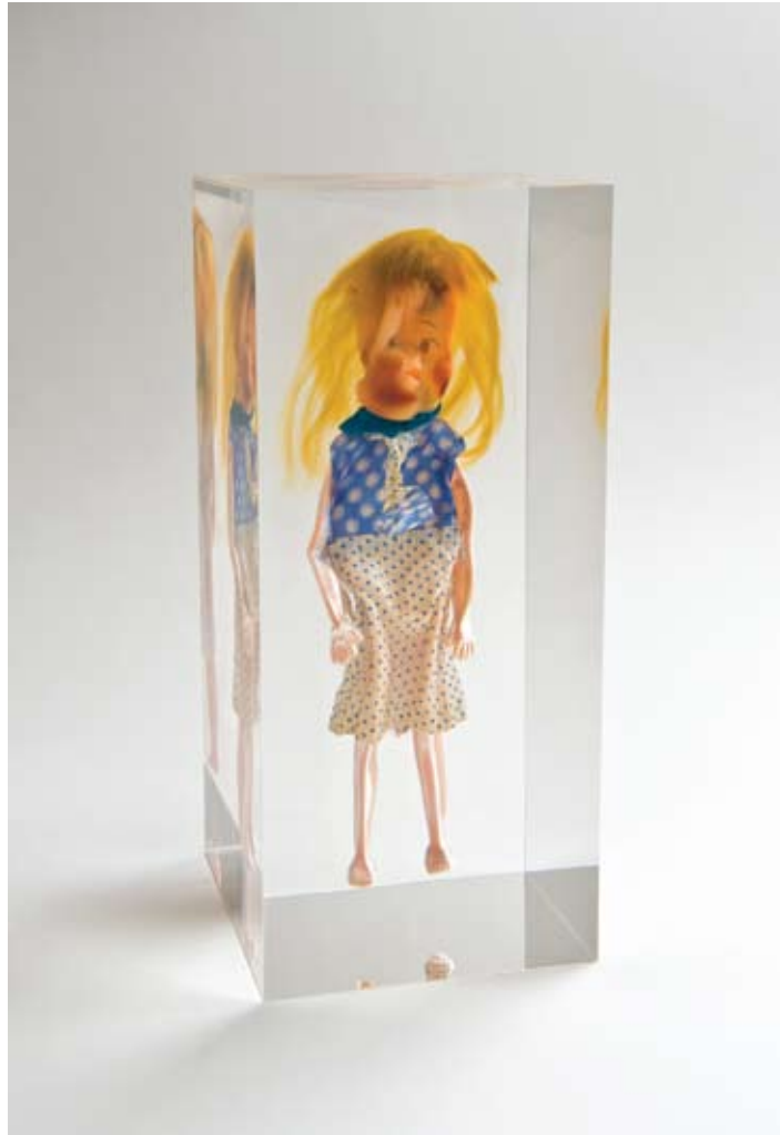
Childhood Tales (Doll in Blue Spotty Dress), 2010