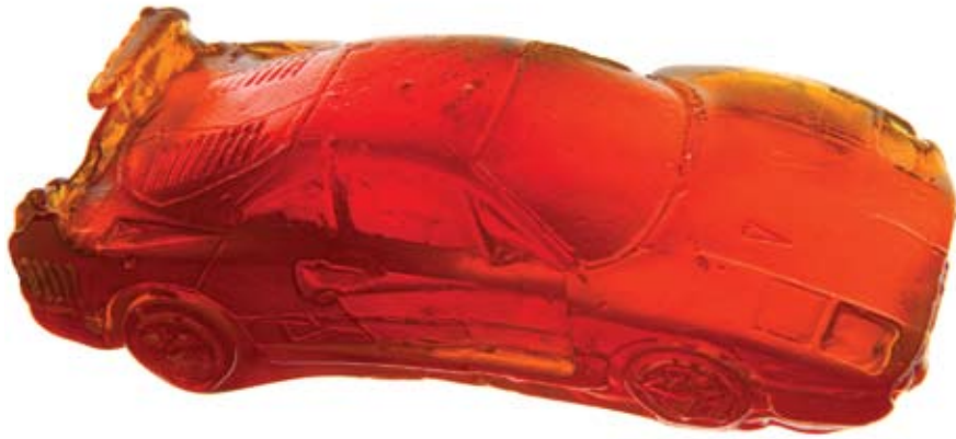
Never Letting Go (Red Ferrari), 2010