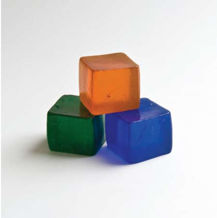
Never Letting Go (Green, Orange & Blue Bricks), 2010