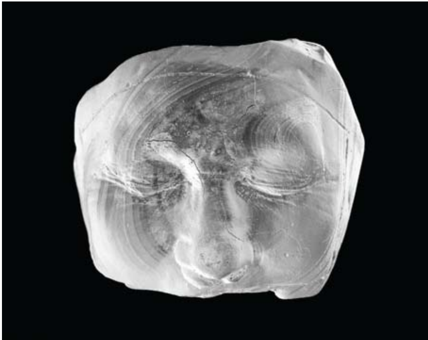
Vanitas 1, 2010, front view