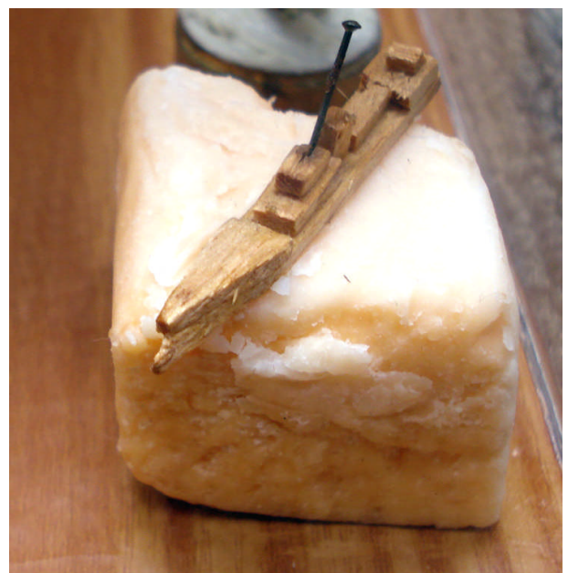
Charlie Franklin - 'Tundra' (Detail)