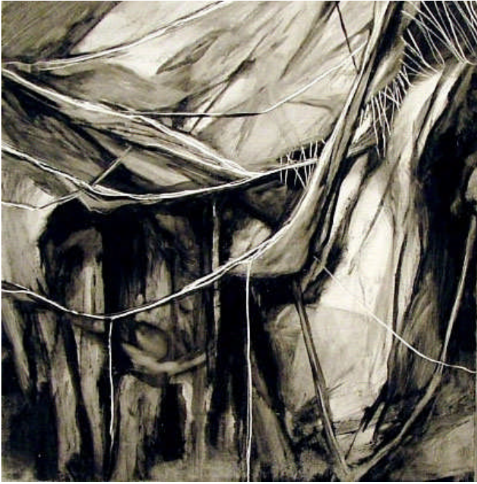
Rachel Kohn - 'Passage Ending 1'